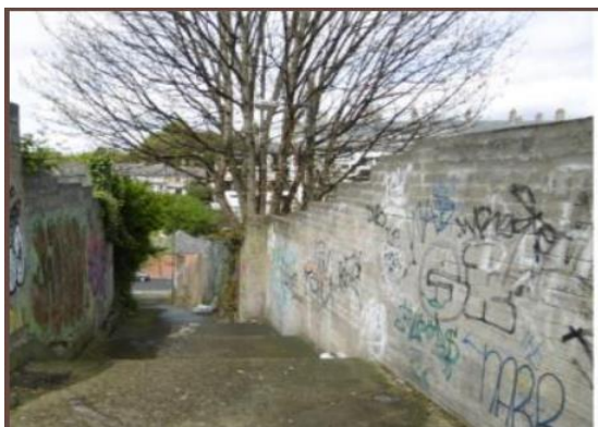
Figure 1 Existing steps

People have welcomed the major refurbishment of current steps at Cameron Sq Mount Brown. Temporary lighting and balustrades are in place pending the final upgrade in coming weeks.