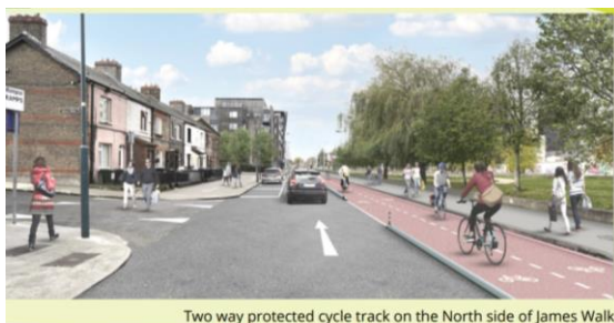
Two way protected cycle track on the North side of James Walk

Suir Road to Thomas St Eng Accessible Singles 0.pdf (dublincity.ie)