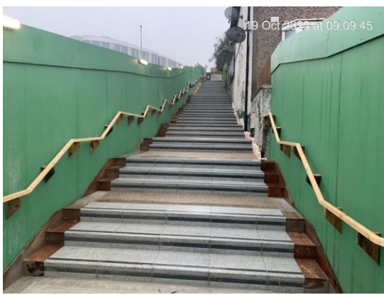
Figure 2 New Steps almost complete Nov 23

The hoarding will remain on the hospital side until the work is complete but residents welcome the upgrade that brings the steps into safe public use again.